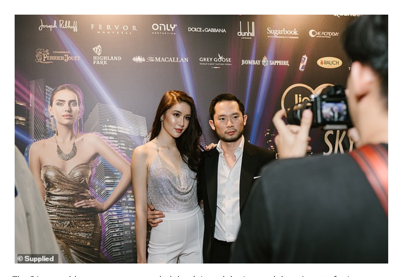
The 31-year-old entrepreneur revealed the do's and don'ts - and the etiquette for 'sugar dating'