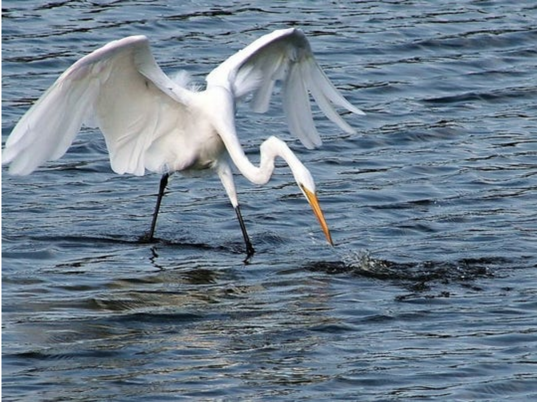
South Carolina: Little River