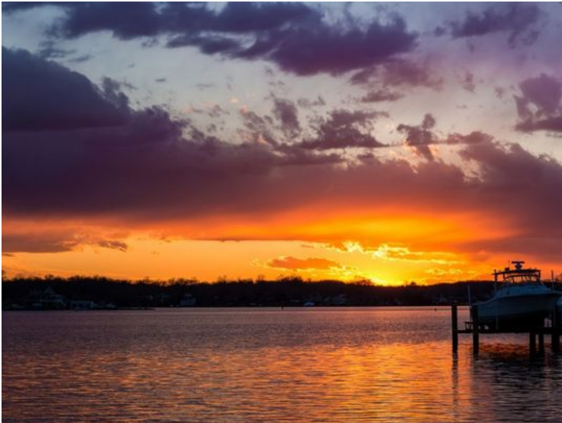
Maryland: Edgewater