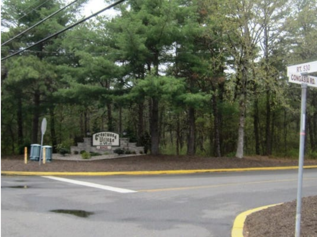
New Jersey: Crestwood Village