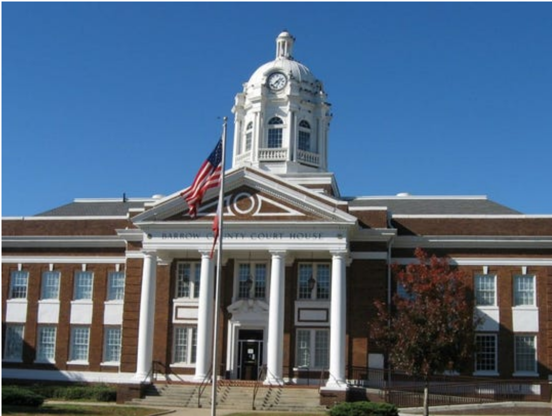
Georgia: Winder