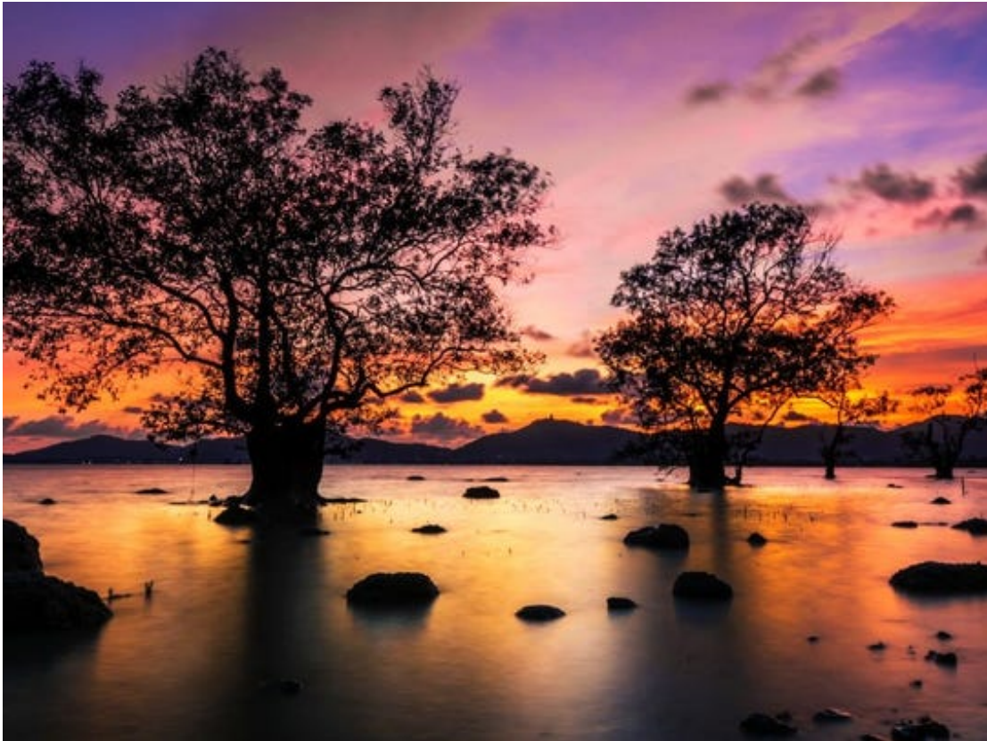
West Virginia: South Charleston